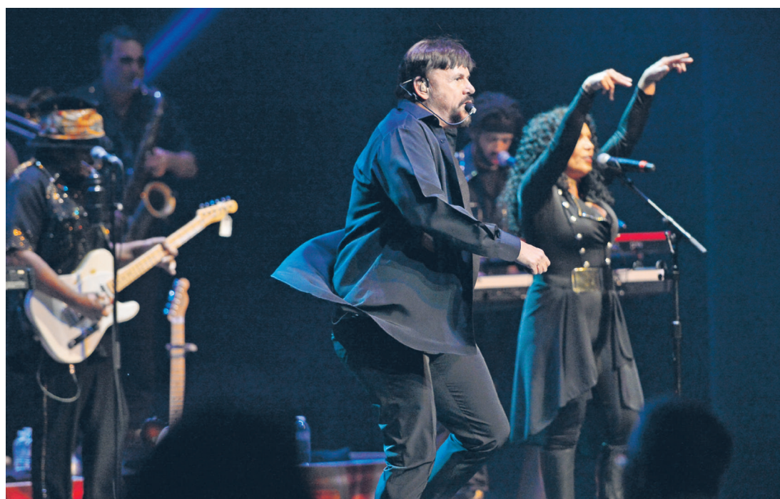
Harry Wayne Casey, center, entertains the crowd during KC and the Sunshine Band's performance of "Boogie Shoes" on Thursday at The Sharon.